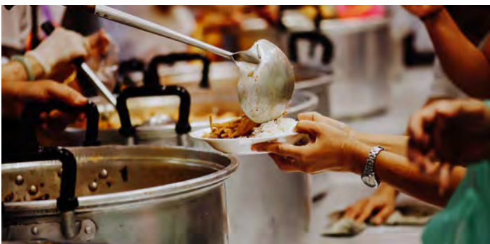
Adults and Children Experiencing Poverty and Homelessness