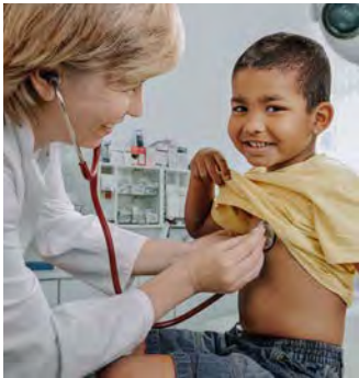
Medical Care and Pro-Life Partners