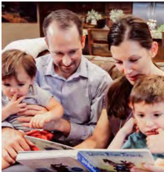
Foster Care and Adoption