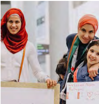
Immigrants and Refugees