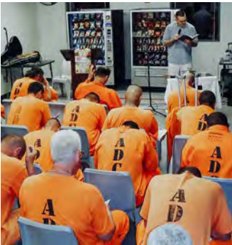
Recovery and Prison Ministry